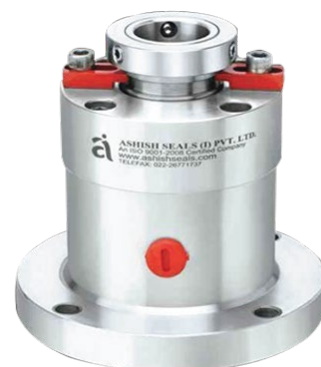
AS93 Bottom Entry Agitator Mechanical Seal