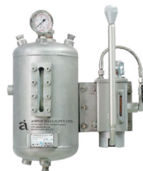
TSP100 Thermosyphon System