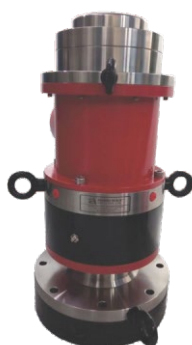
RJ93 Dual Flow Rotary Joint