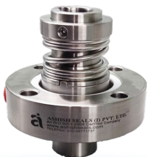
PS34 (CX) Pre Assembled Cartridge Mechanical Seal