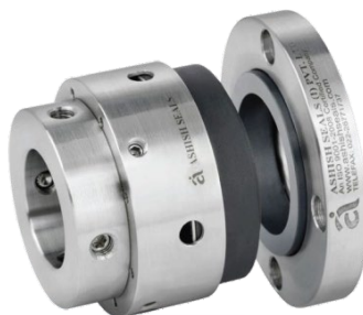
DS71 Dry Running Mechanical Seal