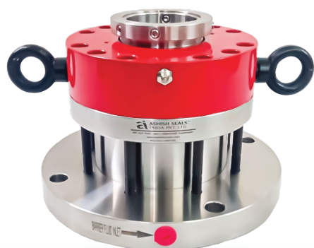
AS91 Horizontal Mount Entry Agitator Mechanical Seals