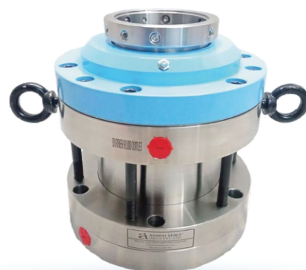
AS98 Agitator Mixer Vessel Mechanical Seals