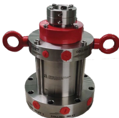
AS97 High Pressure Agitator Double Mechanical Seal