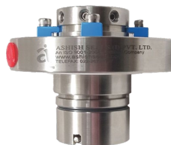
CS53 Double Cartridge Mechanical Seal