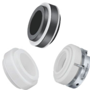
BS13 Teflon Bellow Mechanical Seal