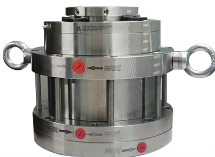
AS92 Double Agitator Mechanical Seal