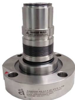
BS14 Hook Type Metal Bellow Semi Cartridge Seal