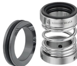
PS34 Single Spring Mechanical Seals