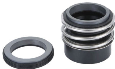
BS11C Rubber Bellow Mechanical Seal Equivalent To MG12