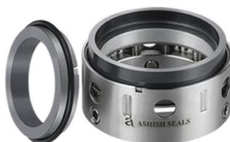
PS38 Multi Spring Unbalanced Mechanical Seal