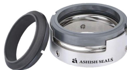
PS40 Wave Spring Mechanical Seal