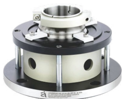
AS94 Glass Lined Agitator Mechanical Seal