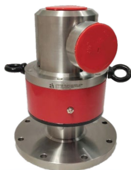
RJ90 Mono Flow Rotary Union